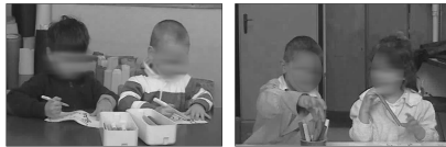
Fig. 1. Experimental setting. The children sit close to one another and fill an album.